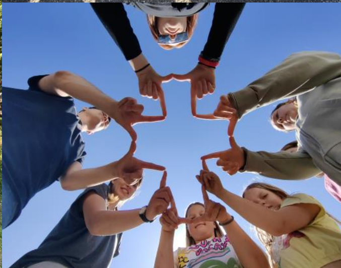
Suur tänu toetuse eest! Thank you very much for your support!